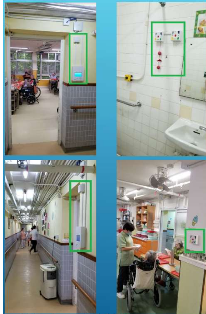
Medical Nurse Call System in Hong Kong