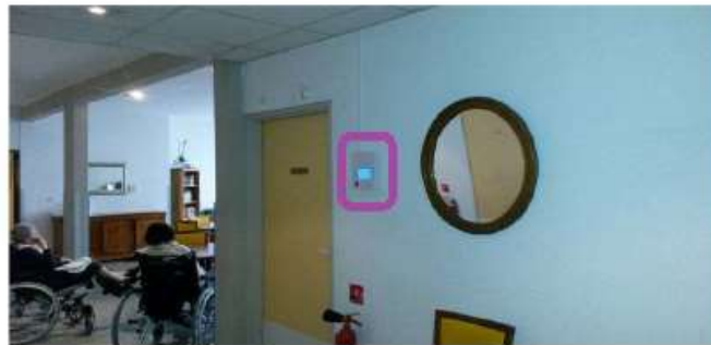
Medical Nurse Call System in France